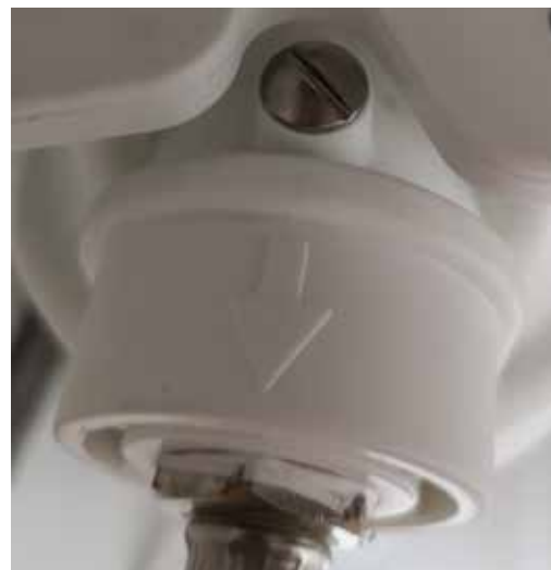
FIG3: DIRECTIONAL ARROW OF WATER FLOW

Note the arrows showing the direction of flow. The arrow points in the direction of flow to the tap. You can mount the bracket either way round according to whether you are installing on the left or the right hand side of the cupboard. Using the phillips head screwdriver, screw the bracket to the filter unit.