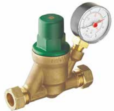
FIG2: PRESSURE REDUCING VALVE WITH GAUGE