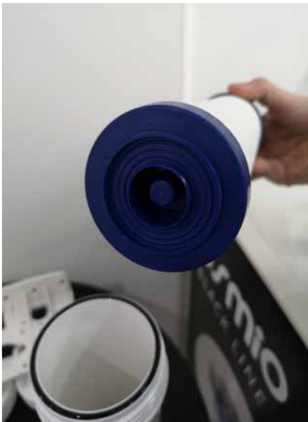
FIG7: THE BOTTOM AND CLOSED END OF THE FILTER

We recommend replacement every 11,000 litres or 6 months whichever comes first.