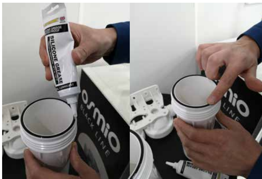
FIG4: GREASING THE O RINGS

Fist clean your hands and then apply the grease to the ring generously and run your finger around the ring as shown.