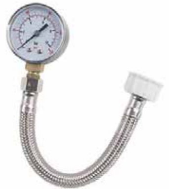
FIG1: WATER PRESSURE GAUGE

Plus any other tools used for the basic plumbing