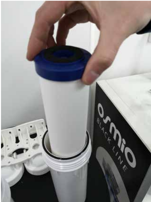
FIG6: THE RUBBER WASHER GOES ON THE TOP OF THE FILTER

Min-Max Pressure: 2 bar - 4.5 bar Recommended flow rate: < 3 LPM