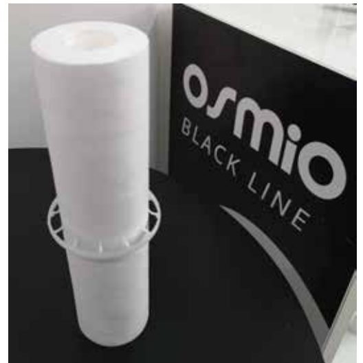
FIG5: SPACING RING IS NOT NEEDED BUT CAN BE USED WITH SEDIMENT FILTERS

Skip to the relevant section for the product you are installing. Please ensure you install the filters in the correct order shown which is in accordance with the flow directions.