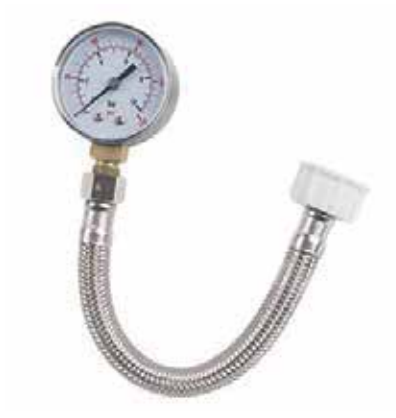
FIG1: WATER PRESSURE GUAGE

Silicone Grease (Plumber's Grease) PTFE tape Spanner & Plumbers Wrench Philips head screwdriver & Flat edge screwdriver Pressure gauge Electric drill with metal drill bits Spirit level Marker pen Appropriate screws to mount the filter to the vertical surface (e.g. wood screws)