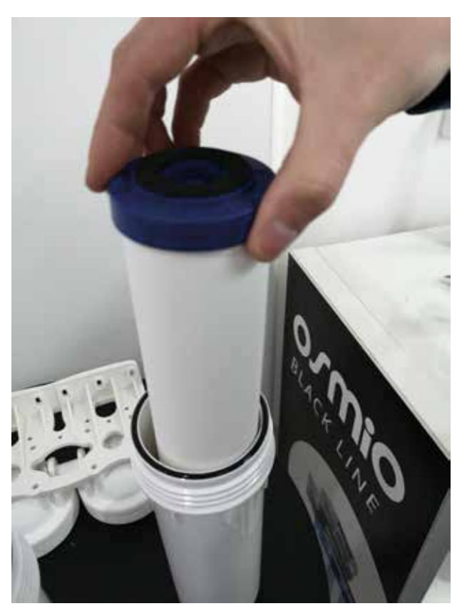
FIG6: THE RUBBER WASHER GOES ON THE TOP OF THE FILER