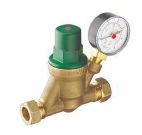
FIG2: PRESSURE REDUCING VALVE WITH GUAGE