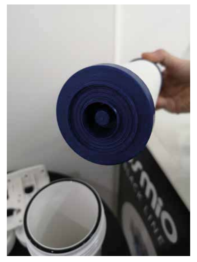
FIG7: THE BOTTOM AND CLOSED END OF THE FILTER

Min-Max Pressure: 2 bar - 4.5 bar Recommended flow rate: < 3 LPM