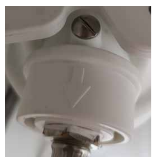
FIG3: DIRECTIONAL ARROW OF WATER FLOW

Note the arrows showing the direction of flow. The arrow points in the direction of flow to the tap. You can mount the bracket either way round according to whether you are installing on the left or the right hand side of the cupboard. Using the phillips head screwdriver, screw the bracket to the filter unit