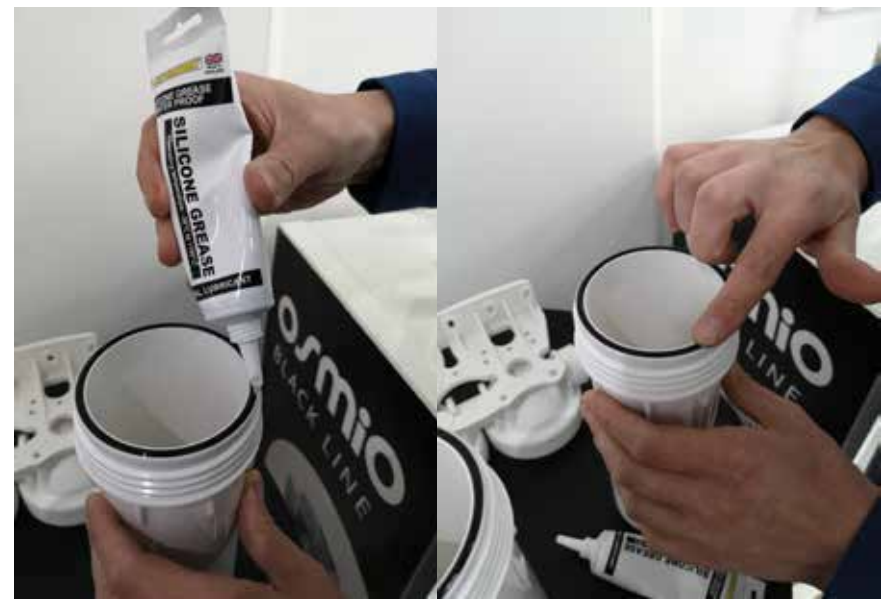
FIG4: GREASING THE O RINGS

Fist clean your hands and then apply the grease to the ring generously and run your finger around the ring as shown.