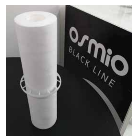
FIG5: SPACING RING IS NOT NEEDED BUT CAN BE USED WITH SEDIMENT FILTERS

Skip to the relevant section for the product you are installing. Please ensure you install the filters in the correct order shown which is in accordance with the flow directions.